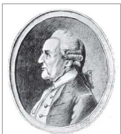
Wilhelm Friedemann Bach